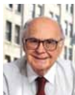
Harold Burson Founder Chairman Burson-Marsteller