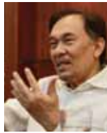
Dr. Anwar Ibrahim Former Deputy Prime Minister of Malaysia and Leader of Keadilan, the People's Justice Party