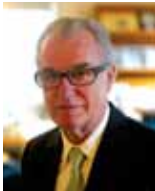
Lord Tim Bell, Chairman

Chairman Chime Communications (Bell Pottinger), UK