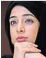
HE Reem Al Hashimy UAE Minister of State & CEO, Dubai Expo 2020 Bid Committee